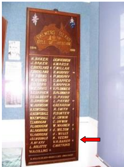
Palmers Island Roll of Honour

V. R. Baker is also remembered on the Palmers Island Roll of Honour located at Yamba Museum, River Street, Yamba, NSW. (Right column – second from bottom)